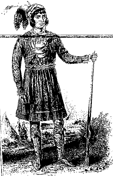
Osceola led the Seminoles in their fight against removal.